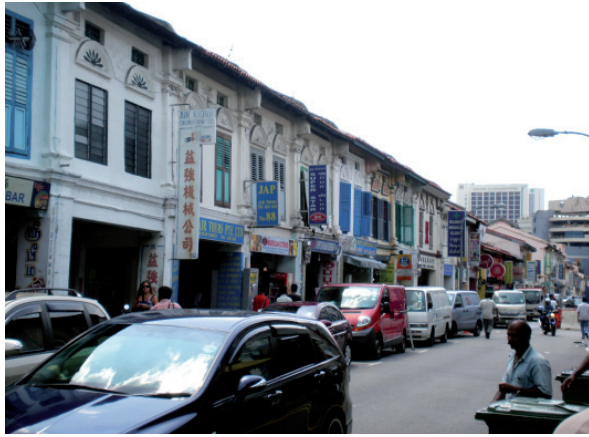
Little India Shophouses: The vintage gaily-painted shophouses in Little India which have become a Singapore icon.