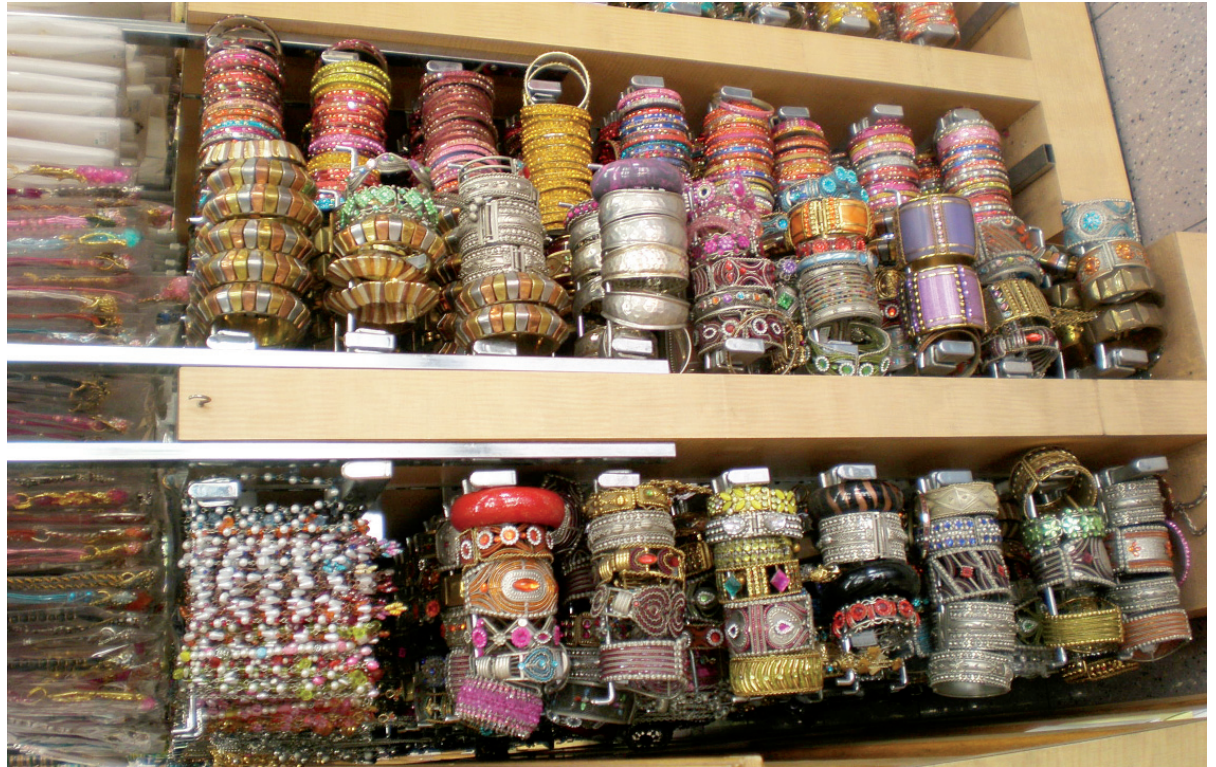
Little India goodies: Little India is packed with shops selling colorful accessories.